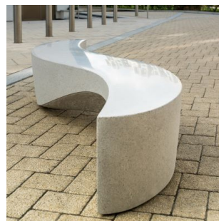
CREATIVE PUBLIC SEATING