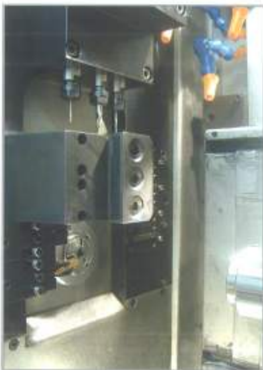
The quick change cartridge for external tool with 12x12 shank.