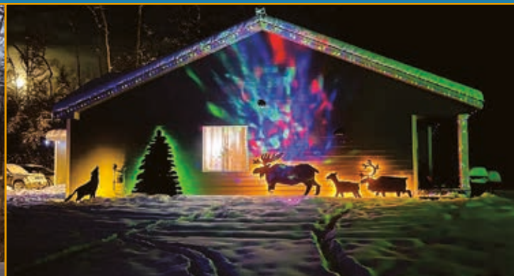
The first and second place residential winners for MEA's 2022 annual holiday lights contest.