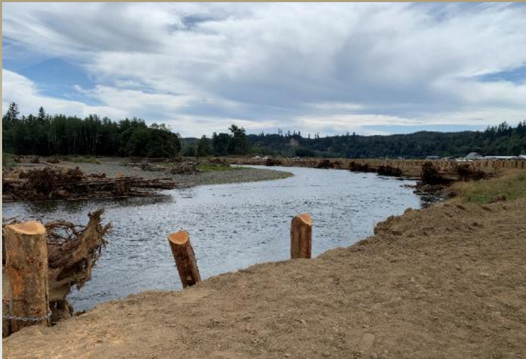
Wynoochee River Engineered Log Jam Deflectors – Grays Harbor CD