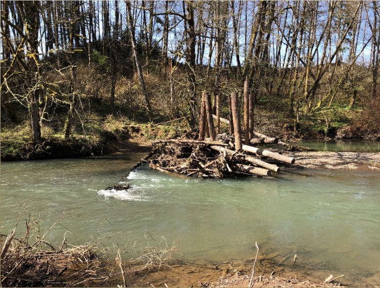
Newly installed engineered log jam on the Skookumchuck River.— Thurston CD