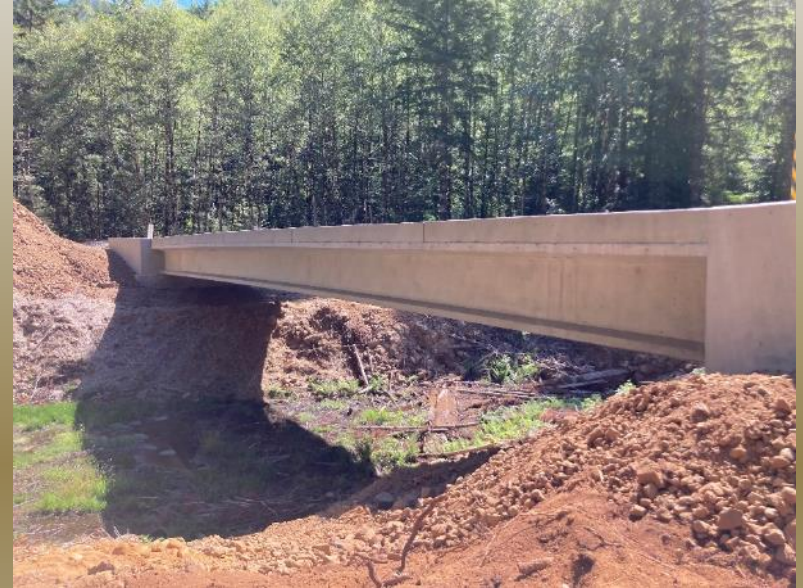
Weyerhaeuser Marker 19 Oxbow reestablishment West Fork Chehalis River – Lewis CD