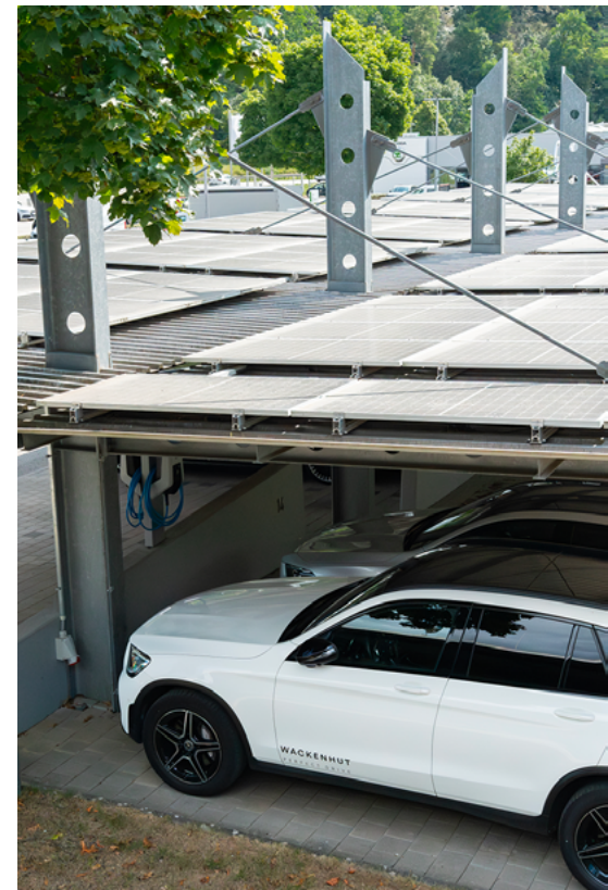
The picture shows a closer view of the PV modules affected by structural shades