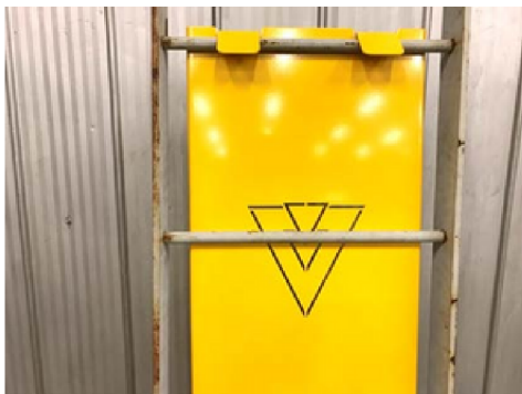
Step 1. Hang guard on ladder