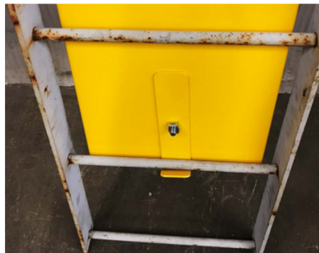
Step 2. Adjust and tighten the lower hook