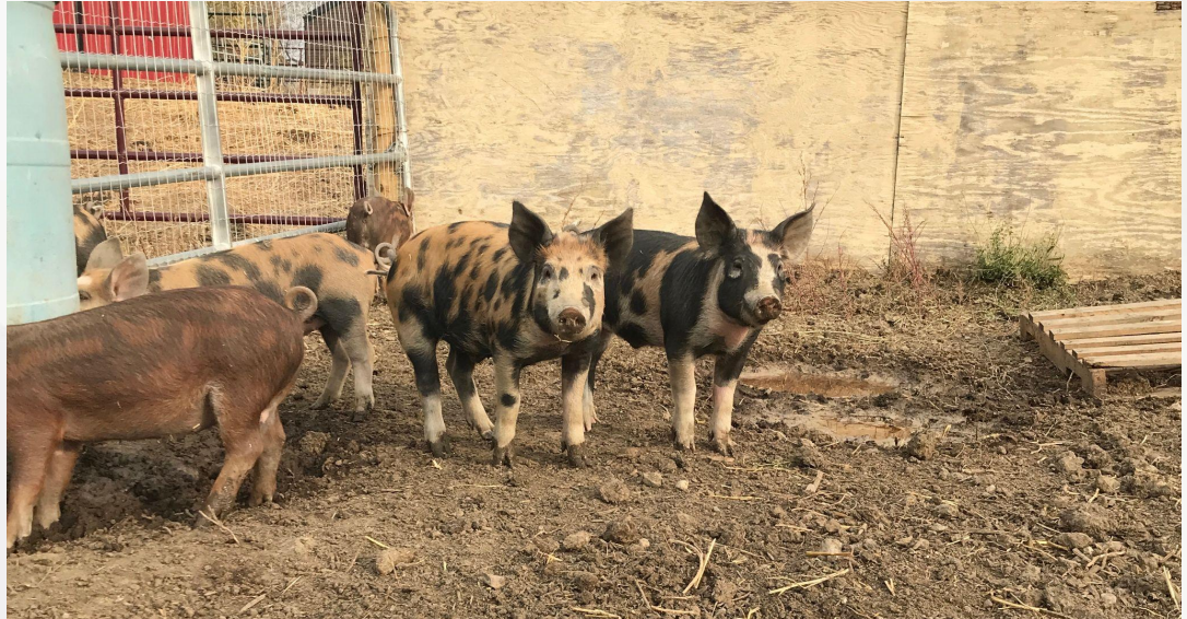
Altario School Farm, October 2021