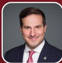
The Hon. Marco Mendicino