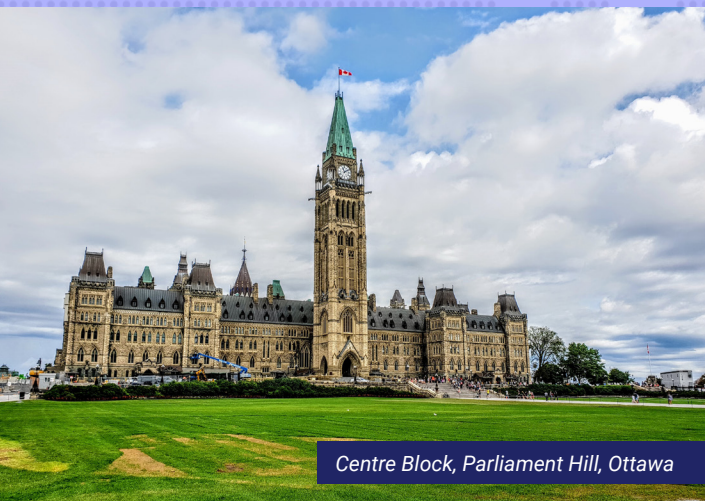
Centre Block, Parliament Hill, Ottawa

Century Initiative shared its perspective on immigration, childcare, and other economic issues with the federal government through our contributions to House Standing Committees federal public consultations, and through submissions to relevant federal ministries, including at the Department of Finance, as well as Immigration, Refugees, and Citizenship. For example, CI presented to House of Commons Standing Committee on Citizenship and Immigration on June 7, 2021 and submitted the following brief .