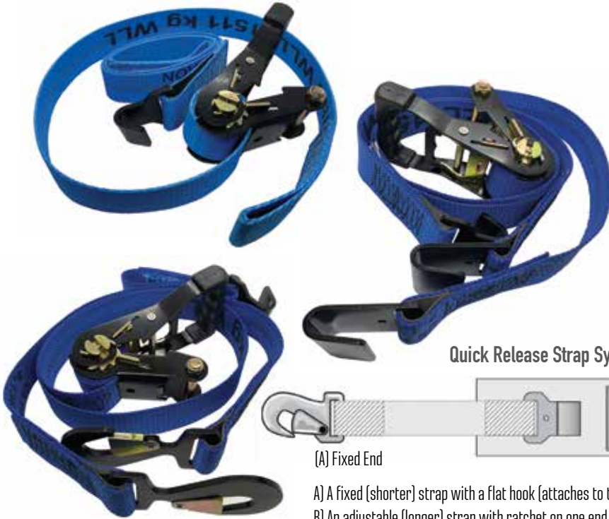
Quick Release Strap System – RATED 3333# Safe Working Load