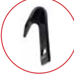
Flat J Hook