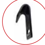
Flat J Hook