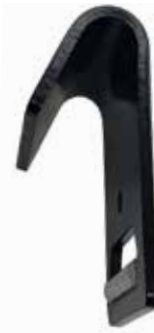
Flat J Hook