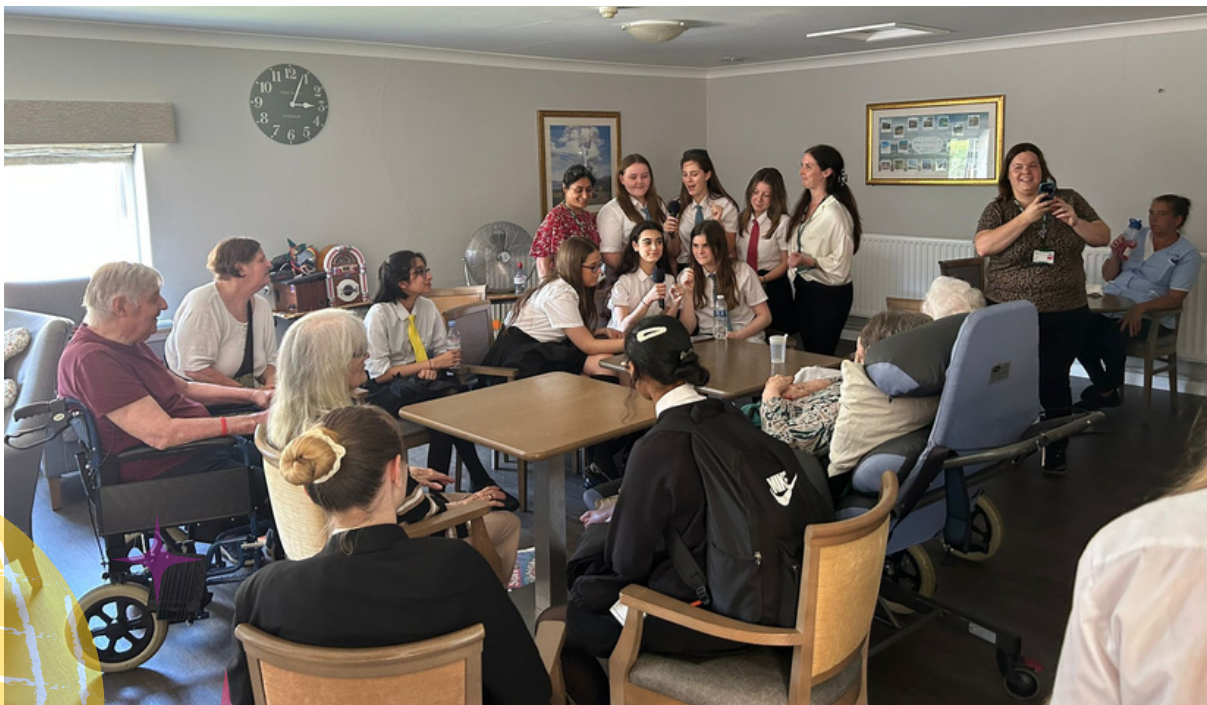
Youngsters from Northfleet Girls School singing 'ABBA's Dancing Queen

The school pupils are buddied up with a member of the care team and receive one-to-one mentoring on the job, allowing them to gain valuable skills and experience in the care home setting. The partnership has been well received by residents, with one saying: "It was the best day seeing loads of youngsters about the home." The working relationship is part of Wombwell Hall Care Home's commitment to engage with the younger generation and raise awareness of social care as a career.