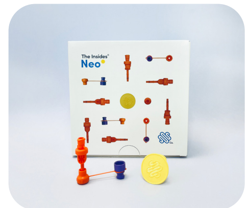
Figure 1. The Inside ® Neo

For more information, please contact The Insides Company, sales@theinsides.co