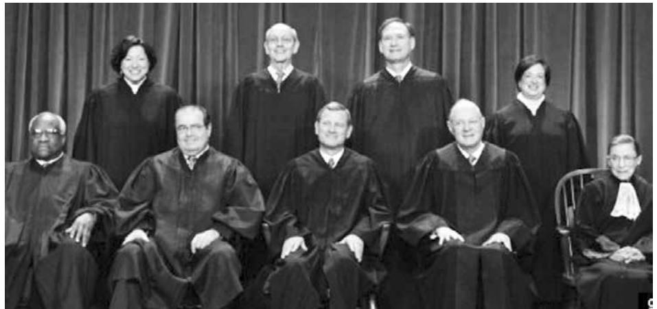
U.S. Supreme Court Justices.