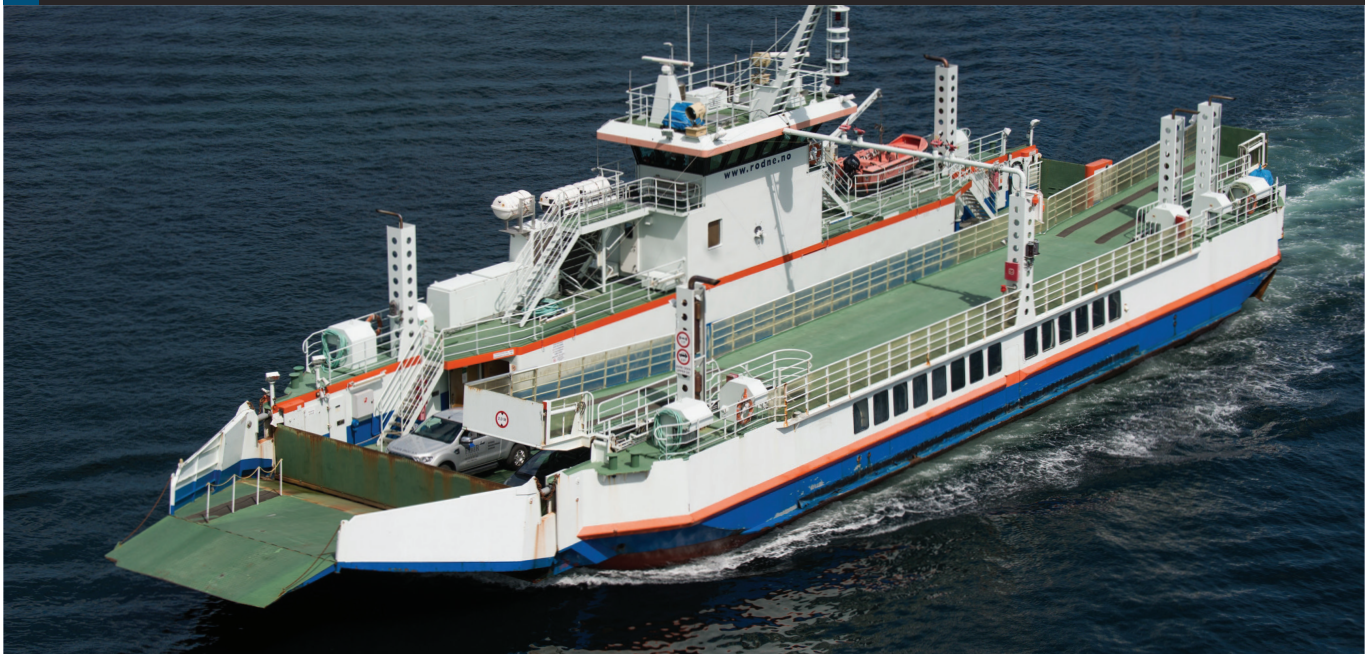
Illustration: Tom Gulbrandsen