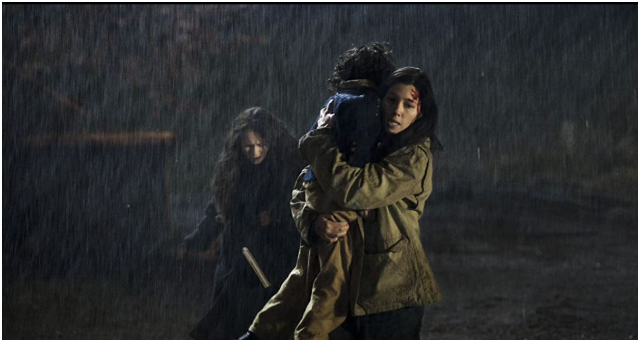
Jessica Biel in The Tall Man (2012)