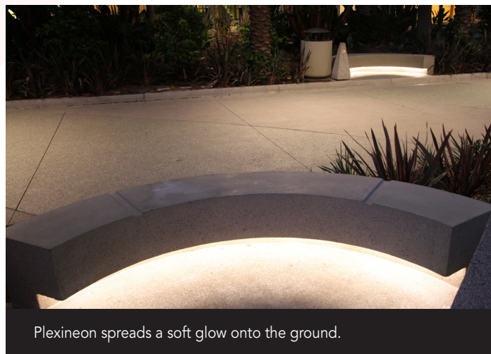
Plexineon spreads a soft glow onto the ground.

iLight LED products can add just the right illumination to your next interior or exterior project. Learn more at our site: www.ilight-tech.com .