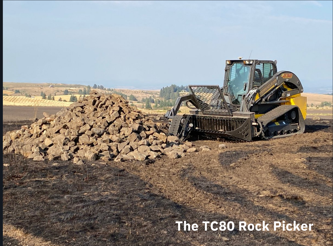
The TC80 Rock Picker