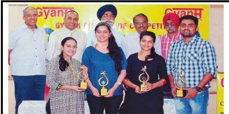
सम्मानित होने के बाद उम्मीदवार।

A certain number of persons are sitting in the row. All of them are facing towards north. Q sits sixth from the right of S. T sits forth to left of Q. Only two persons sit between Q and P. R sits forth to the left of S. U sits between S and T. V sits second to the right of U. W is third from any of the end. S is eight from the left end of the row. Six persons sit between W and V.