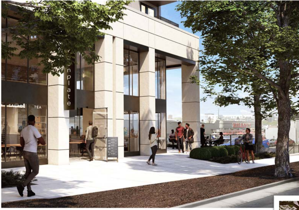
RETAIL ENTRANCE VIEW