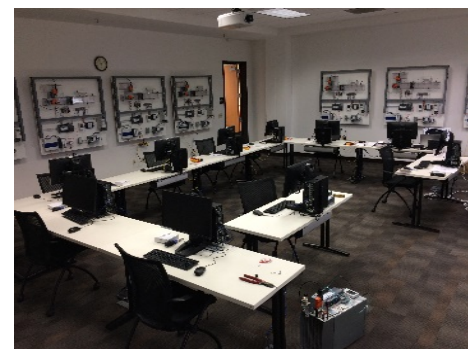
Small class sizes to enhance your learning experience.

The Syserco Practice-Based Learning Center – a Hands-On Learning Environment –