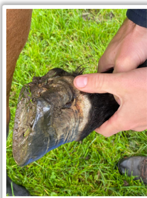
Damage done to the hoof.

Pick out the mud or sticky clay checking for stones or foreign items that can do harm to the hooves and to see if the hooves need to attended by the farrier for trimming or shoeing.