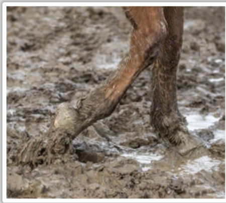
Wet sticky mud .

We have to let our horses out into the fields to allow them to get exercise and get fresh air they are animals that thrive on been out in the field. Exercise is what makes the whole body of the horse work as it should and to keep it healthy.