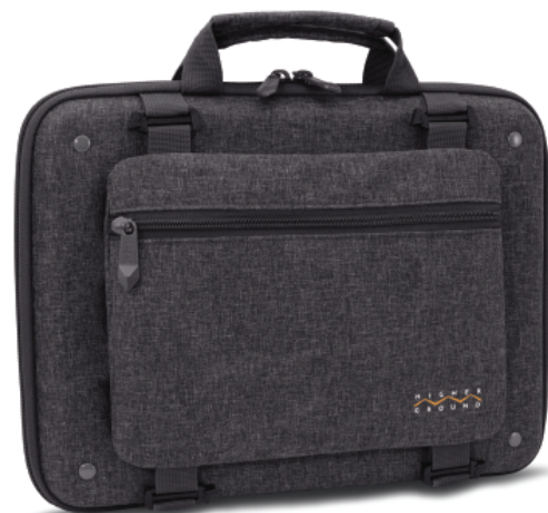
With Power Pocket - PP001 (Power Pocket Sold Separately)