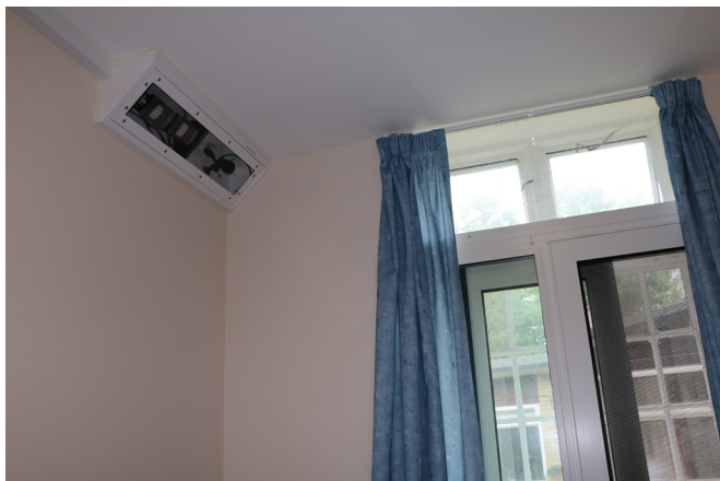
Figure 1 Digital sensor in bedroom.

The key innovation in this project is the use of Oxhealth sensors, which employ a software that uses computer vision, signal processing and AI techniques to track micromovements and colour changes (through photoplethysmography) on the body from several metres away. From these small signals, the pulse rate and breathing rate can be calculated. These techniques are akin to an automated version of the counting of chest movements commonly used in hospitals and a non-contact version of the widely used finger pulse oximeter. There is therefore no disturbance to the patient, and a breathing rate can still be calculated when the patient is fully covered by bedding. Previous studies have evaluated the technology in specific populations: renal patients undergoing dialysis, 22 neonates in intensive care, 23 adults in intensive care, 24 and patients and staff in a high-security mental health setting. 25 The British Standards Institute, acting as a notified body on behalf of the Medicines & Healthcare products Regulatory Agency, has accredited the sensors' vital signs measurement software as a class IIa medical device in Europe (figure 1). The sensors use an infrared camera, attached to a discreet wall-mounted monitor so they can function at night without having to switch lights on.