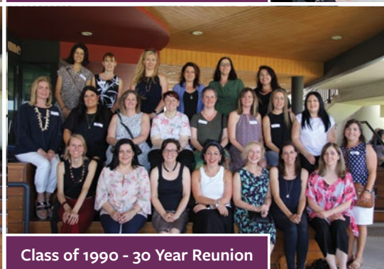
Class of 1990 - 30 Year Reunion