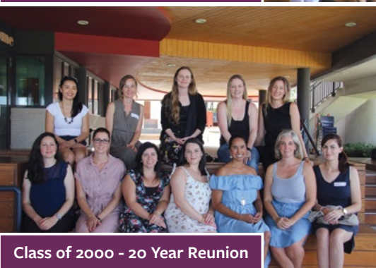
Class of 2000 - 20 Year Reunion