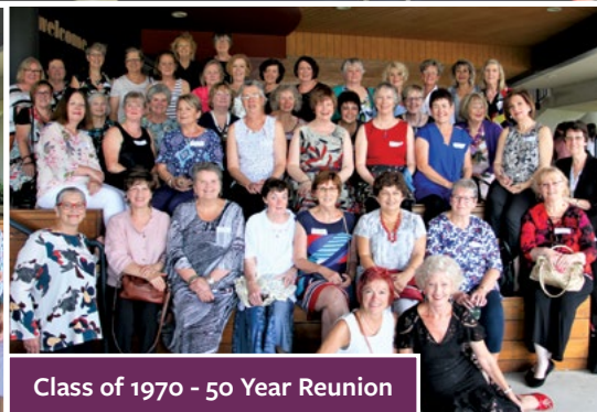
Class of 1970 - 50 Year Reunion