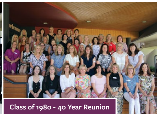
Class of 1980 - 40 Year Reunion