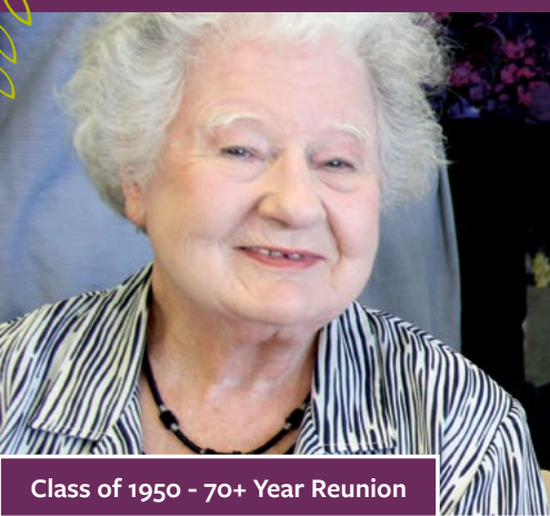
Class of 1950 - 70+ Year Reunion