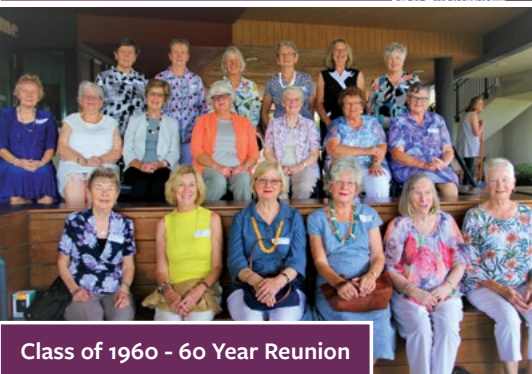
Class of 1960 - 60 Year Reunion