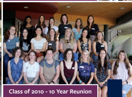
Class of 2010 - 10 Year Reunion