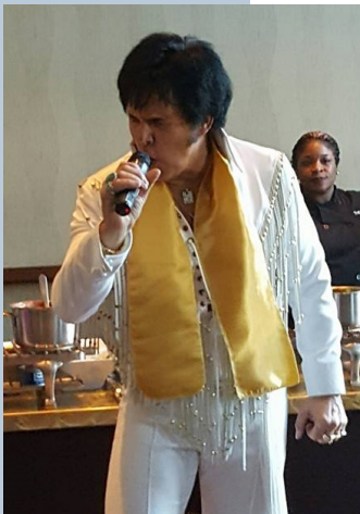
You never know who will show up at the Annual Meeting—including "The King!"

In addition, attendees had an opportunity to network and let their hair down, as well, as they enjoyed a show from the one and only "Elvis Presley."