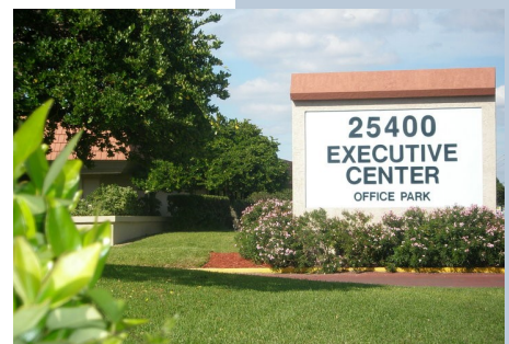
CAAHEP’s New Headquarters in Clearwater, Florida