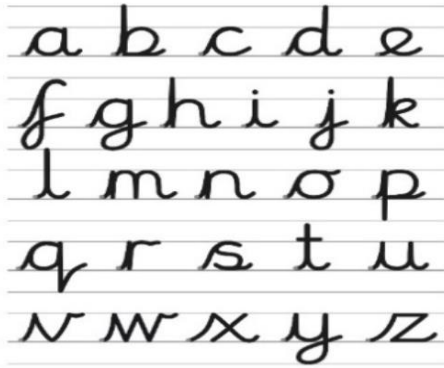
Cursive Lower Case Letters

of pictures. Please see below for the Year 1 and 2 Common Exception Words (these are words children in year 1 should be able to accurately spell and read fluently) and the cursive lower case letters. Practising these regularly at home will better support your child to develop.