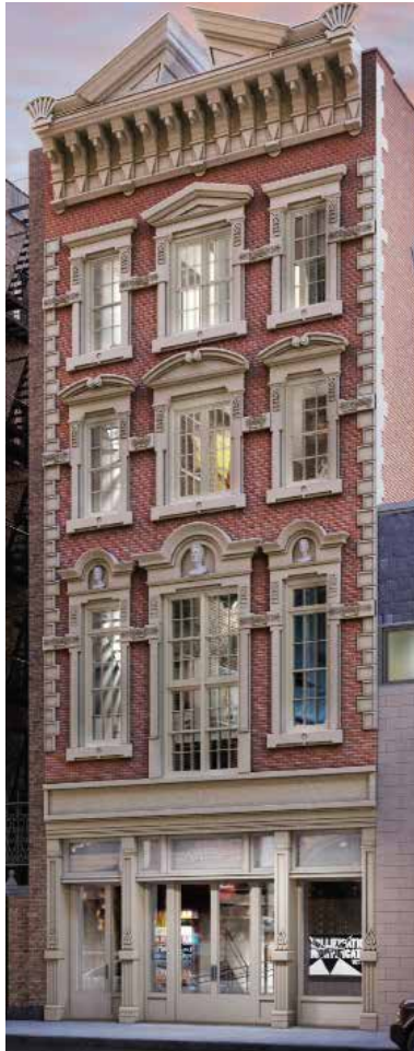
Rendering: 74 East 4th St.

La MaMa's historic, landmark building at 74 East 4th Street is undergoing an urgently needed complete renovation and restoration to preserve the historic façade, create building-wide ADA accessibility, and provide much needed performance, exhibition and community space for decades to come.