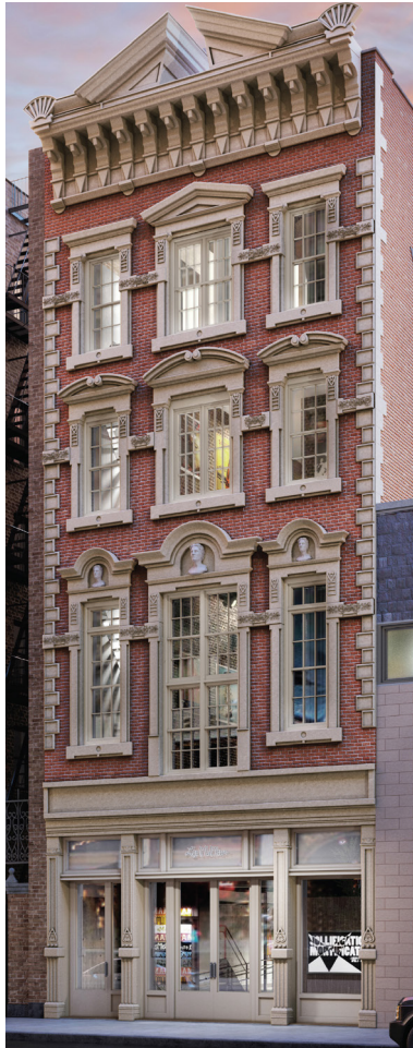
Rendering: 74 East 4th St.

La MaMa's historic, landmark building at 74 East 4th Street is undergoing an urgently needed complete renovation and restoration to preserve the historic façade, create building-wide ADA accessibility, and provide much needed performance, exhibition and community space for decades to come.