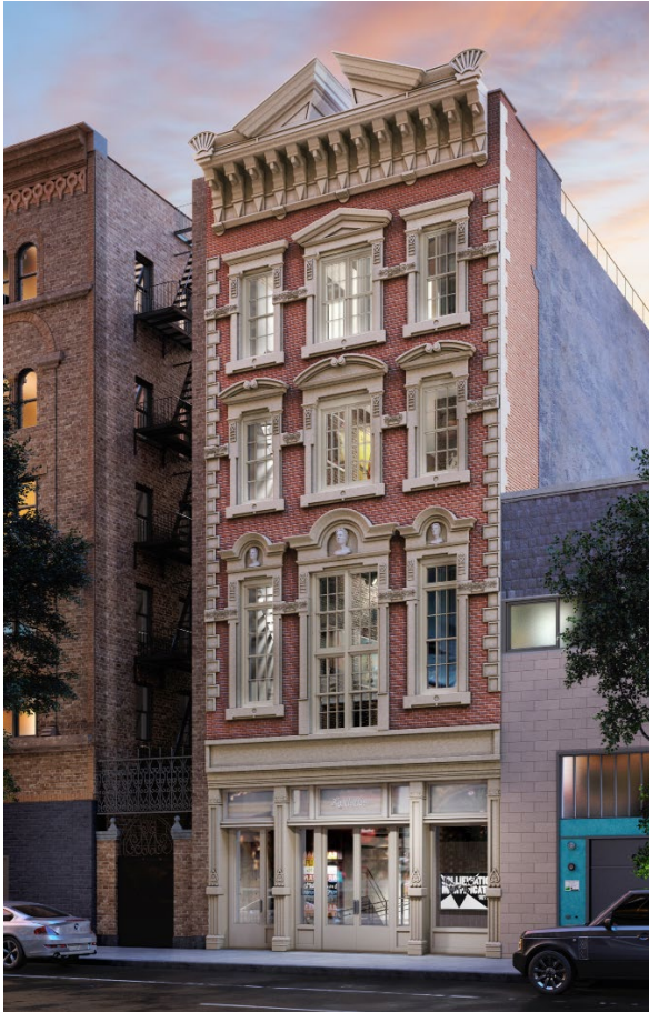
Rendering: 74 East 4th St.

La MaMa's historic, landmark building at 74 East 4th Street is undergoing an urgently needed complete renovation and restoration to preserve the historic façade, create building-wide ADA accessibility, and provide much needed performance, exhibition and community space for decades to come.