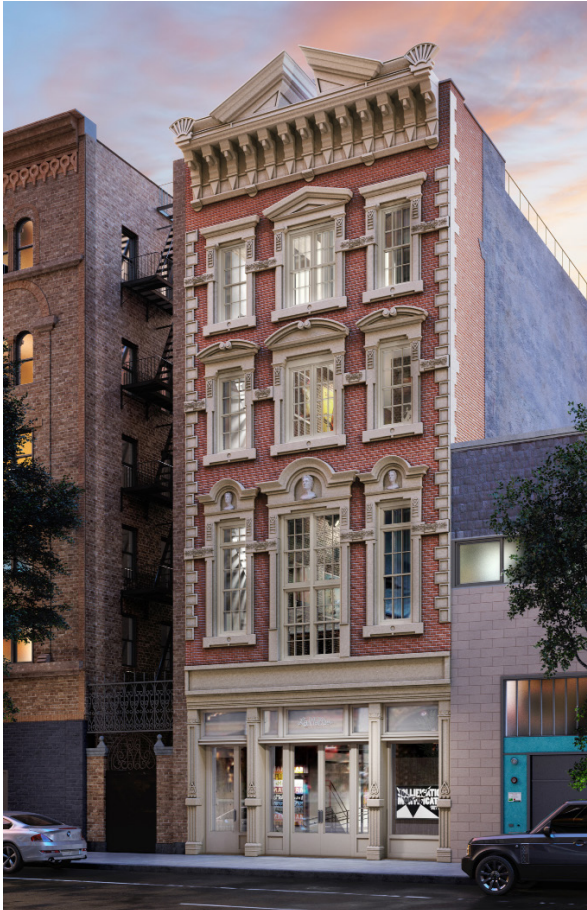
Rendering: 74 East 4th St.

La MaMa's historic, landmark building at 74 East 4th Street is undergoing an urgently needed complete renovation and restoration to preserve the historic façade, create building-wide ADA accessibility, and provide much needed performance, exhibition and community space for decades to come.