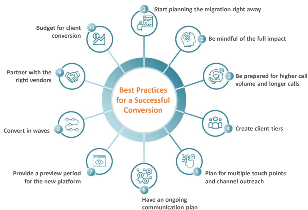
Figure 2: Best Practices

While no conversion is perfect, there are steps banks can take to minimize their risk and ensure greater success. These steps can be applied to not only cash management system conversions, which have a high potential for disruption, but also include any client-facing digital banking platforms such as payments, loan origination, and cards. This section highlights some best practices and lessons shared by bankers and those who have witnessed both successful and unsuccessful platform conversions (Figure 2).