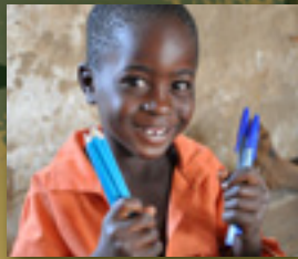
School Stuff $15 *