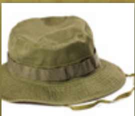
Game Ranger Hat/Sunglasses $30