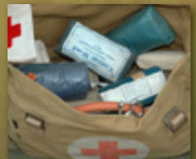
Medical Kit $150