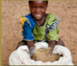
Seeds $40 *