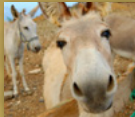
Donkey $225 *