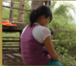
Stop Child Exploit $40 *