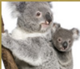
Koala Adoption $50