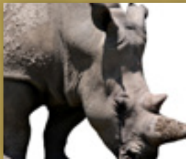
Rhino Adoption $50