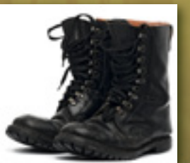
Ranger Boots $40