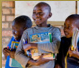
Education Pack $195 *