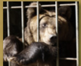
Stop Bear Bile $30