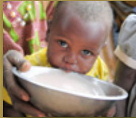
Food for Children $40 *