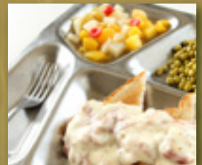
Ranger Food 1 wk $20