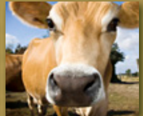
Cow $265 *