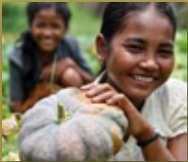
Garden Starter $45 *