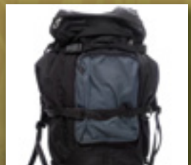
Ranger Backpack $60