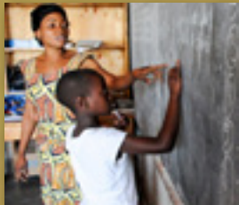
Train Teacher $125 *