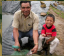
Fish Farm $25 *