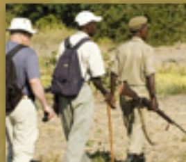
Game Ranger Income $40