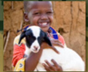
Goat $40 *