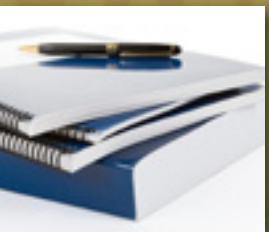
Game Ranger Textbooks $40