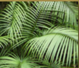
Buy Rainforest 1mt² $50