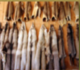
Stop Fur Trade $30