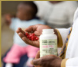
Vitamins $45 *