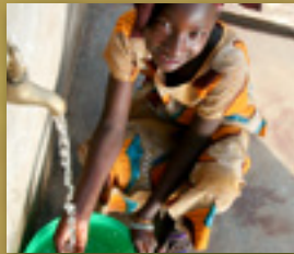
Clean Water $60 *