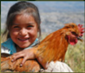
Chicken/Feed $10 *