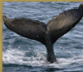
Stop Whaling & Dolphin $30