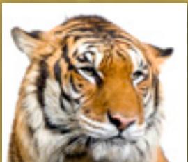
Tiger Adoption $50