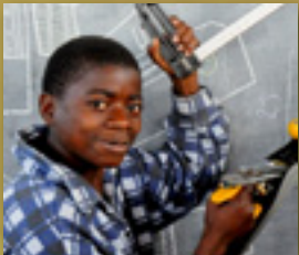
Trade Tools $100 *