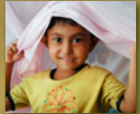
Mosquito Net $40 *