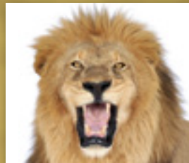
Lion Adoption $50