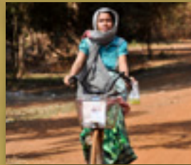
Bike $100 *