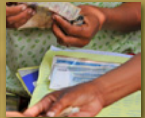
Business Loan $100 *