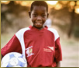
Sport Stuff $40 *