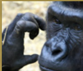
Gorilla Adoption $50