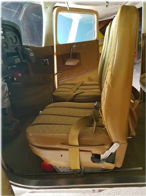
C182 seats before repair & upholstery