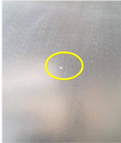
Grinded during repair