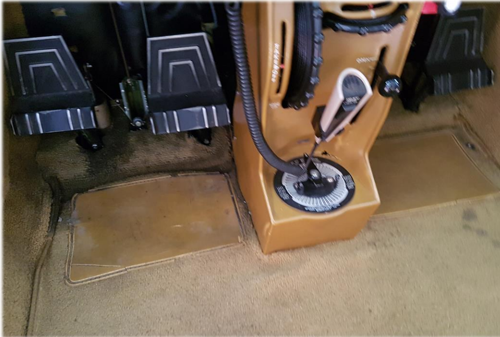
C182 carpet before replacement