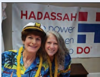
Onboard and ready to explore the world of Hadassah one port at a time!

As they prepared to dock, two new members are welcomed into the chapter. Heartfelt gratitude was extended to the ship-shape volunteer crew!