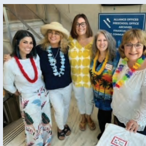
Sailing away to new horizons and endless possibilities