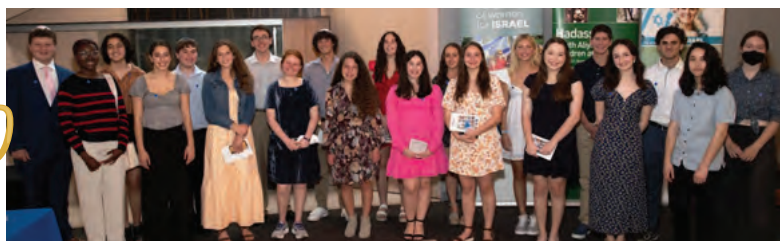
2023 Chesed Student Award Winners