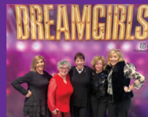
"Dreamgirls" of Hadassah Birmingham enjoying the performance together on February 18th