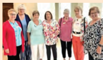
Celebrating Annual Givers!