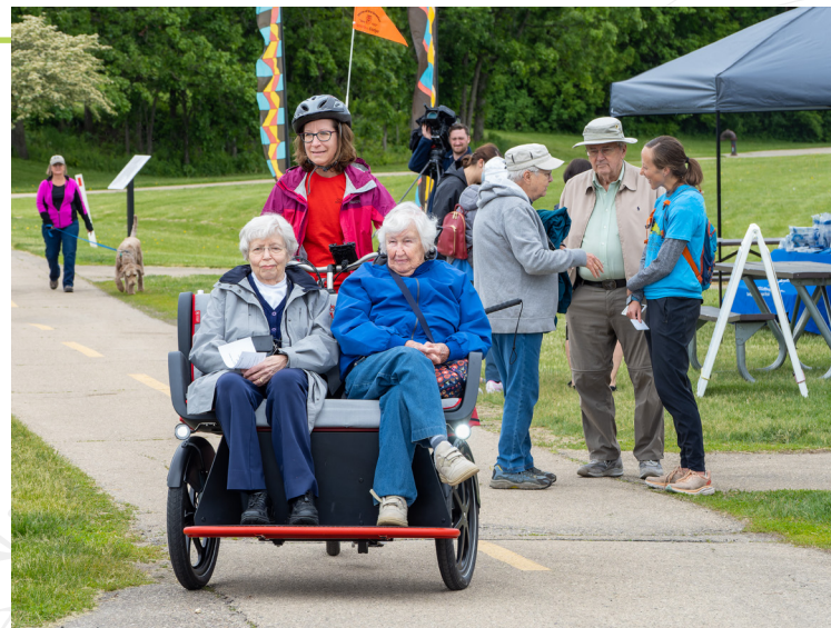
Naturalist-led tours by trishaw made exploring Pheasant Branch Conservancy more accessible.

The Friends of Pheasant Branch Conservancy (FOPBC) will expand their Make a Memory Days program which provides adults with limited mobility and/or mild to moderate dementia with sensory-based nature experiences. Previous sessions have included forest bathing, slow and deliberate nature walks, local musicians, nature learning stations led by Master Naturalists, and music therapy.