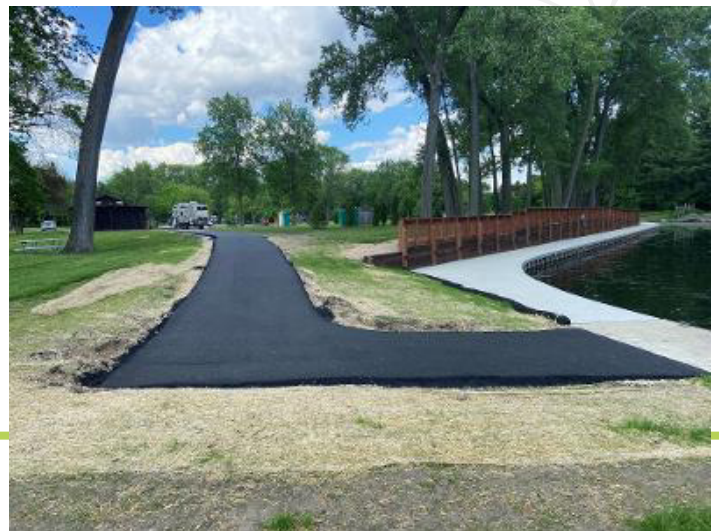
Mendota County Park Pier