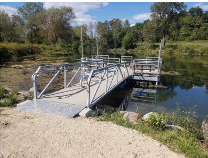
Salmo Pond County Park Pier

Mendota County Park: Access has been improved for shore fishing and boat camping with the completion of a new accessible path and the restoration of a retaining wall and seawall. A concrete walkway now extends the entire length of the lagoon and provides great shore fishing opportunities.