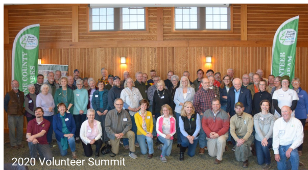
2020 Volunteer Summit