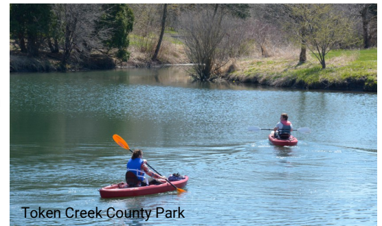
Token Creek County Park