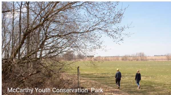
McCarthy Youth Conservation Park