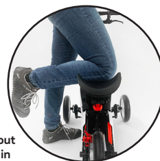
Ergonomic pad with Cutout for „turning on the spot“ in narrow spaces