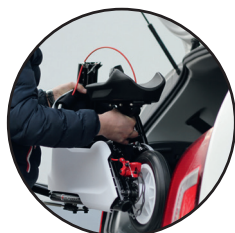
Toolless assembly and disassembly