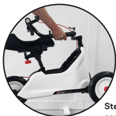
Steering unit as carrying handle for easy transport