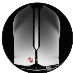
Reflectors all around for more visibility