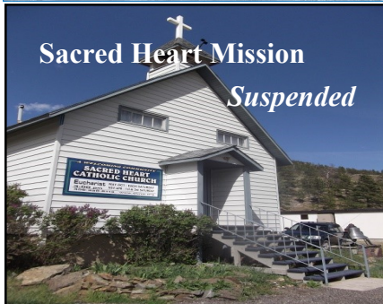
Sacred Heart Mission Suspended