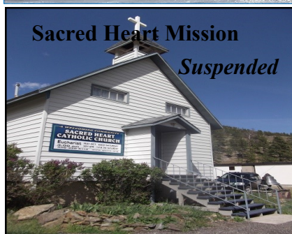
Sacred Heart Mission Suspended