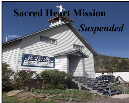
Sacred Heart Mission Suspended