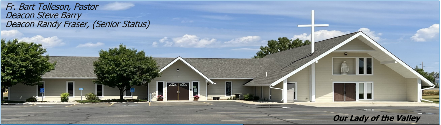
Our Lady of the Valley