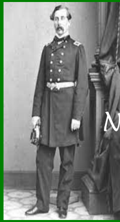
Montana's First Acting Territorial Governor Thomas Francis Meagher

For more information about an upcoming Retrouvaille Weekend program for couples, contact registration team: at 1-800-470-2230 or visit www.HelpOurMarriage.com Not counseling or group therapy. All contacts and names are held in strictest confidence.