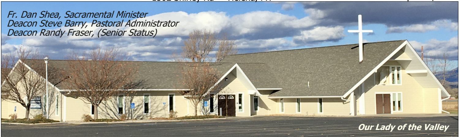
Our Lady of the Valley