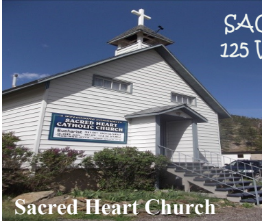
SACRED HEART CHURCH 125 Walsh St Wolf Creek, MT