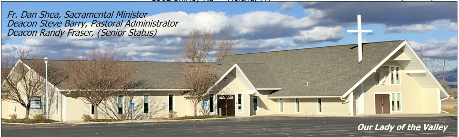
Our Lady of the Valley