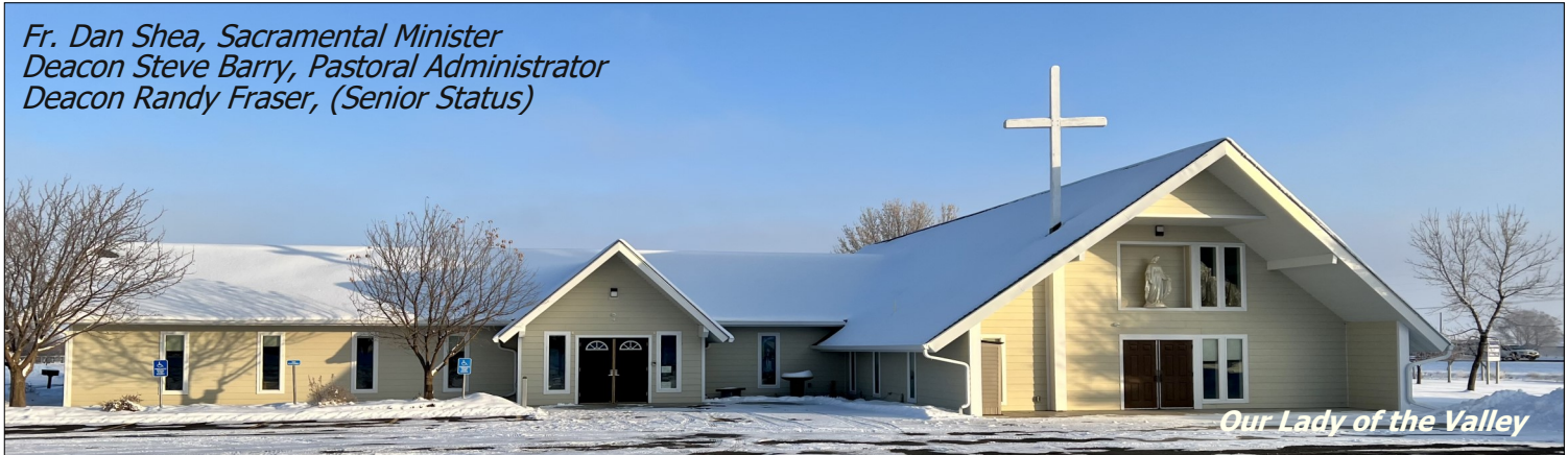
Our Lady of the Valley