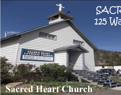
SACRED HEART CHURCH 125 Walsh St Wolf Creek, MT