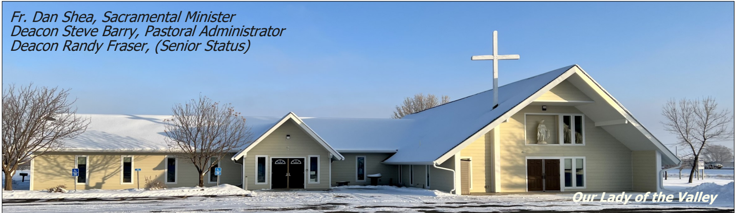
Our Lady of the Valley