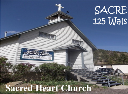
SACRED HEART CHURCH 125 Walsh St Wolf Creek, MT