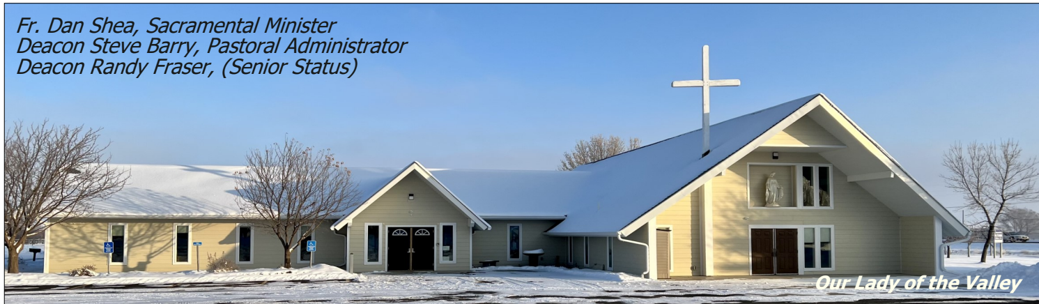
Our Lady of the Valley