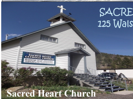
SACRED HEART CHURCH 125 Walsh St Wolf Creek, MT