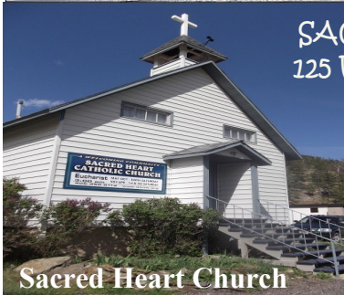
SACRED HEART CHURCH 125 Walsh St Wolf Creek, MT