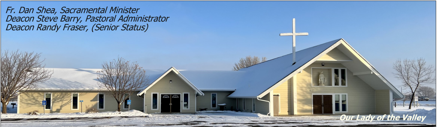
Our Lady of the Valley