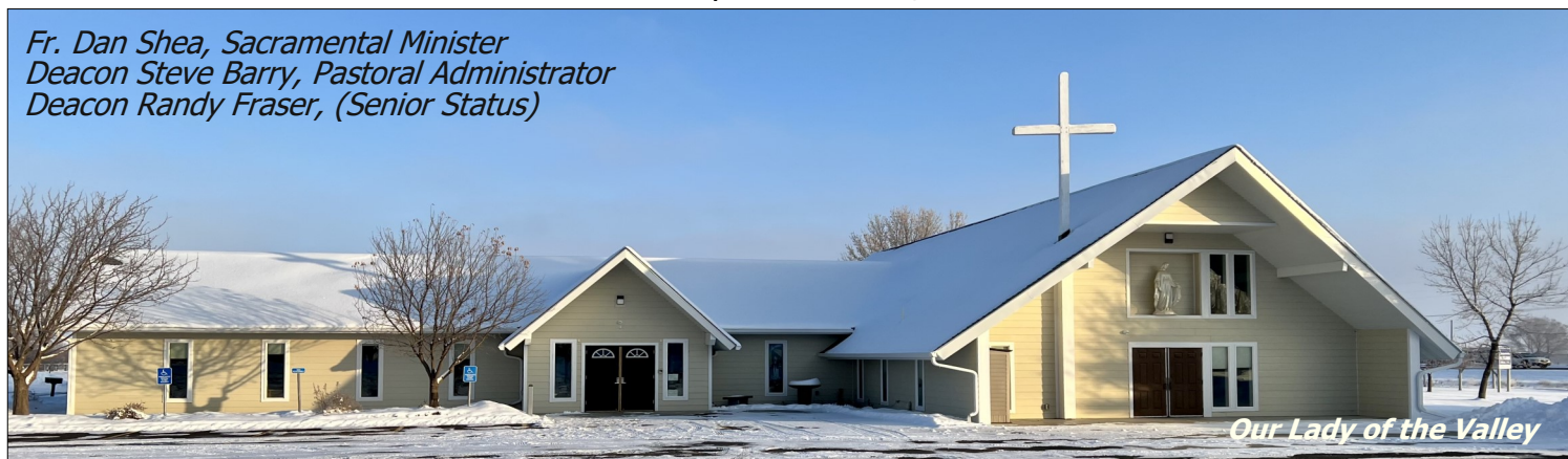
Our Lady of the Valley