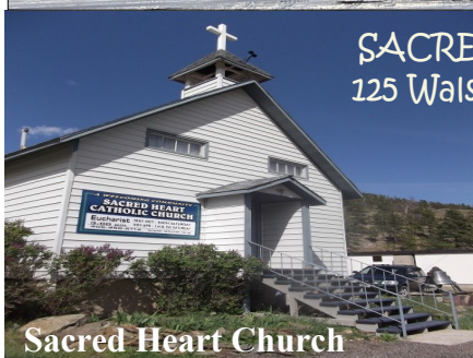
SACRED HEART CHURCH 125 Walsh St Wolf Creek, MT